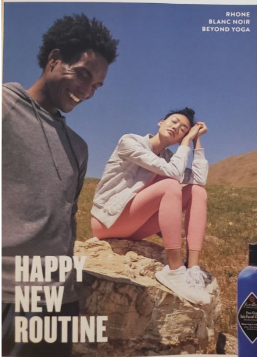
RHONE BLANC NOIR BEYOND YOGA