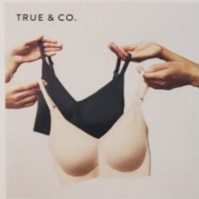
TRUE & CO.

Stock up and save on wardrobe staples and beauty bonus sizes.