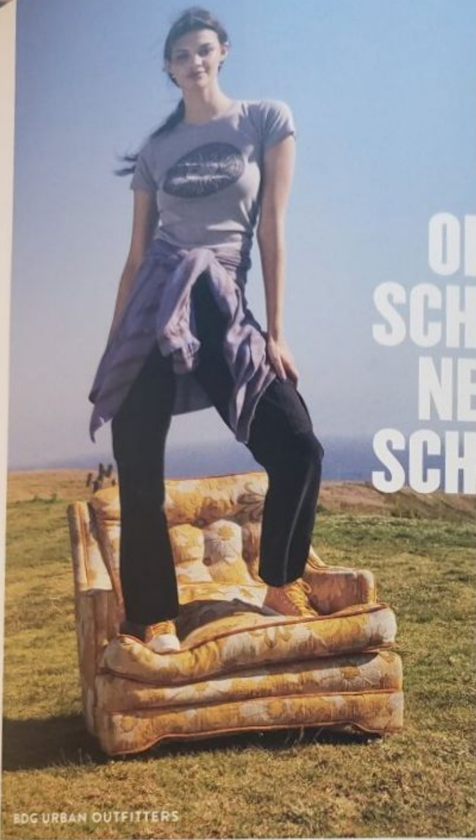
BDG URBAN OUTFITTERS