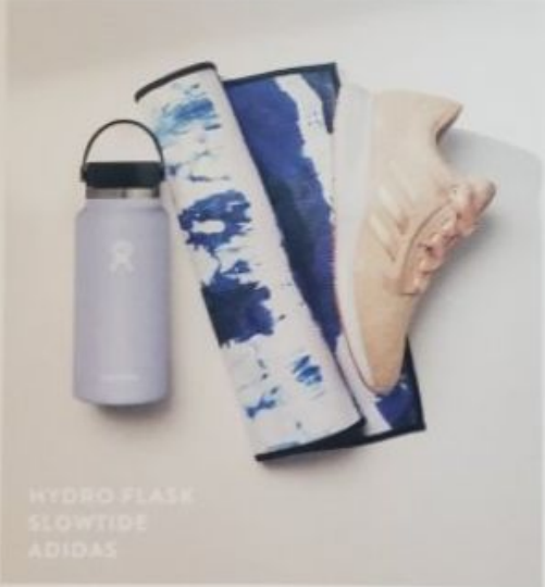
HYDRO FLASK SLOWTIDE ADIDAS