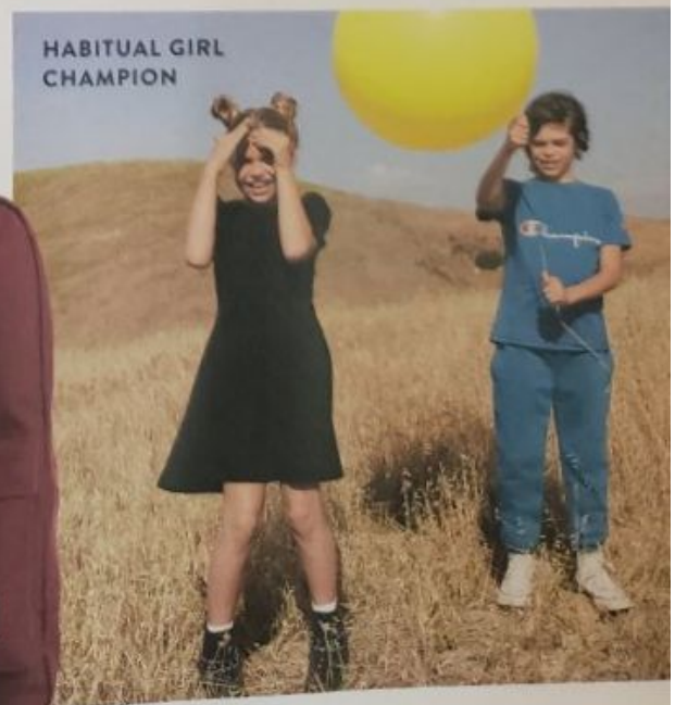
HABITUAL GIRL CHAMPION